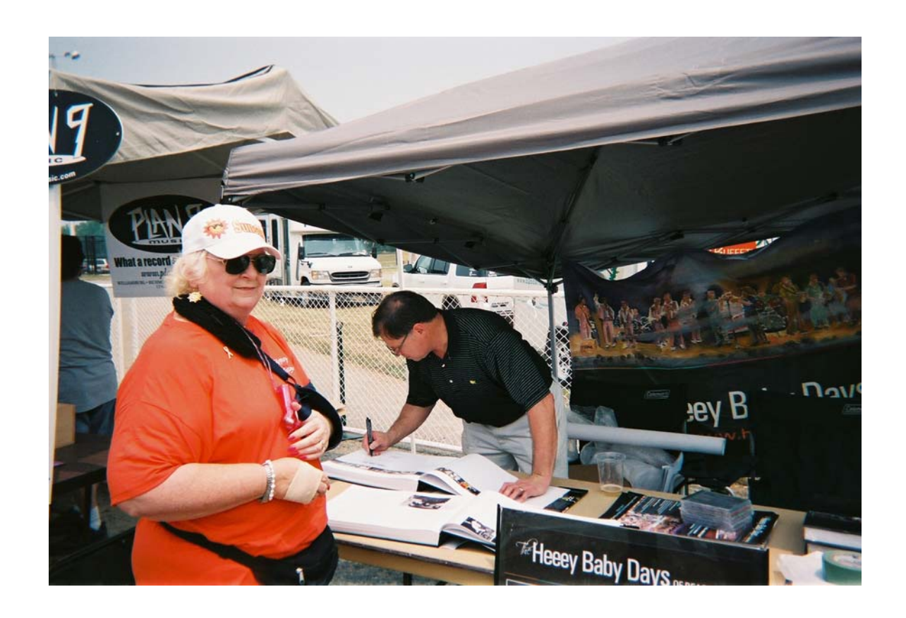
Plan 9 Richmond has only a few books remaining in their Cary Town store..

Gearing up for the weekend' Jekyll Island Georgia Beach Music Festival. We will be flying the Heeey Baby Days of Beach Music banner selling and signing the book as follows: