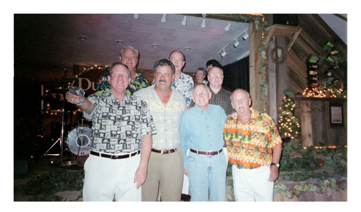
We'll get the i.d. for these early members of the Jetty Jumpers soon!